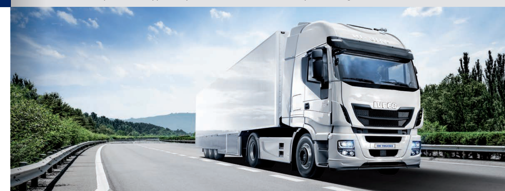
Key Fuel Saving Factor: ACCELERATION